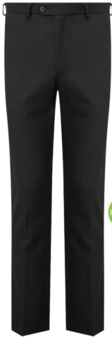
Only Black Trousers To Be Worn