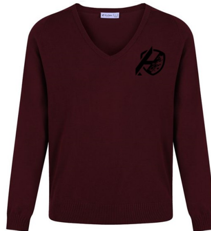
M,Fit Maroon Unisex Jumper C/w Embroidered Badge