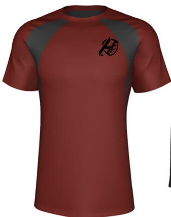
Unisex PE Encore Performance T-Shirt