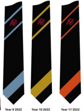
2022 52" Standard Year Tie