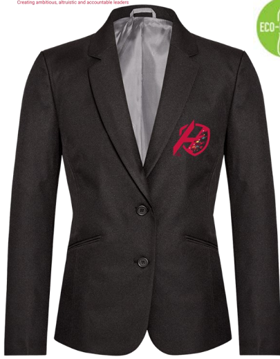
DL1994 Black Unisex Blazer C/w Embroidered Badge