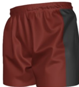
Unisex PE ZR50 Performance Shorts