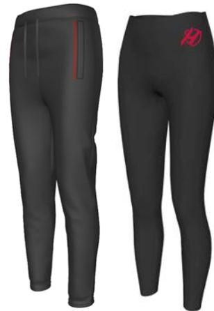
Unisex ZR45 Pants Or DL7002 7/8 Leggings