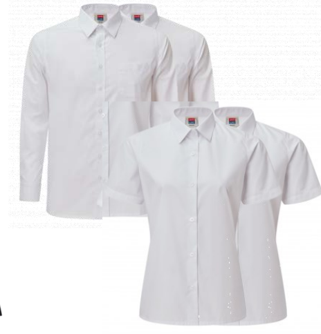
White, Long Sleeve Or Short Sleeve, Shirts Or Blouses