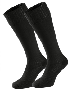
Black Football Socks