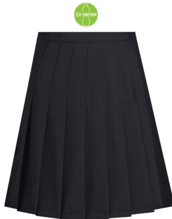
Only Black DL972 Skirt To Be Worn.