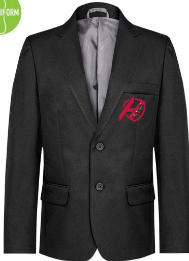
DL1995 Black Fitted Blazer C/w Embroidered Badge