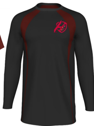
Unisex PE Encore ZR42 Sweat Shirt